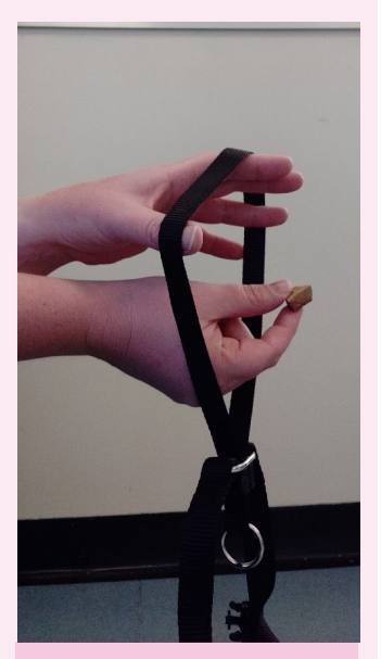
Holding a treat through the nose loop