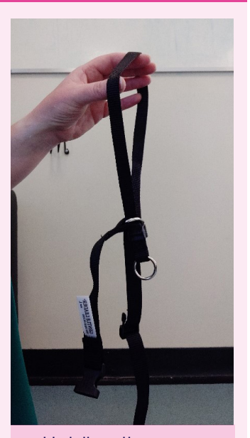
Holding the nose loop open

Once your dog is able to put their nose in the nose loop on cue, you can move onto the next stage.